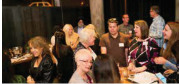
It was a fun mix of folks from both Bridle Trails and Newcastle.