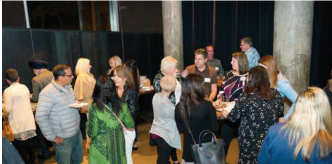
It was a fun mix of folks from both Bridle Trails and Newcastle