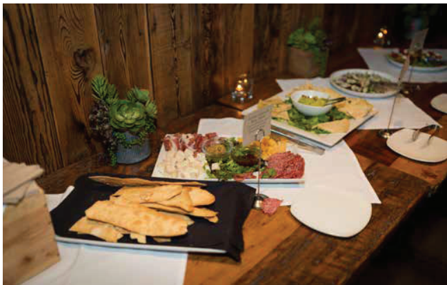
Purple served a delicious spread for us!